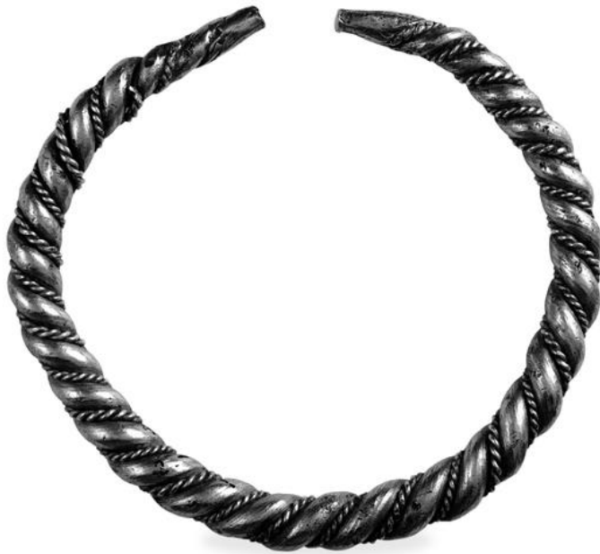
Gold arm-ring Viking 10th century AD